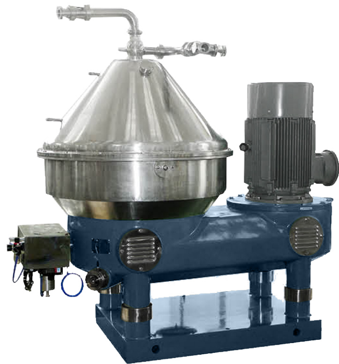
DBY series Disc Stac Centrifuge

DBY series Disc Stack Centrifuge adopts a CO2 inlet system to control brew oxidation, surely provide hermetic working process.